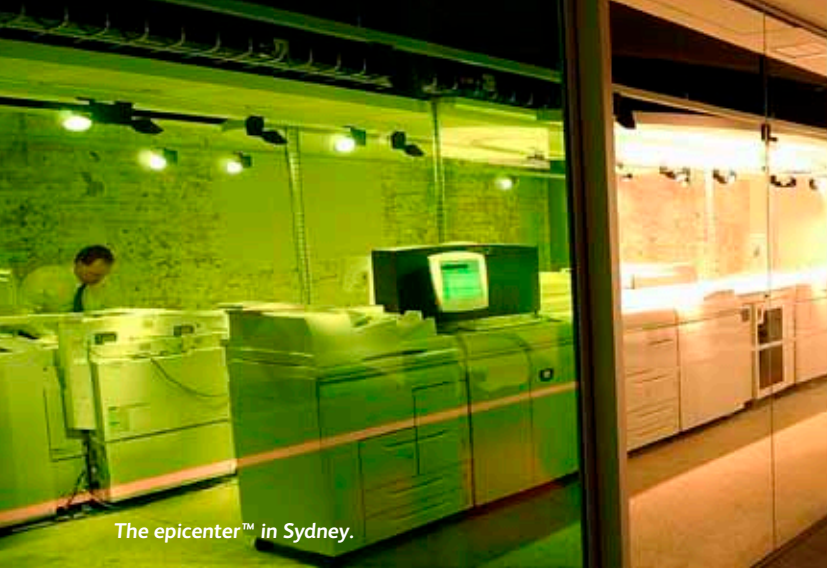
The epicenter™ in Sydney.